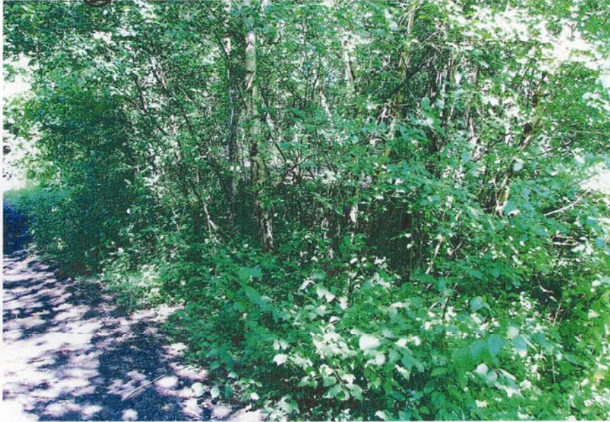
AREA ④ CLEAR ALL EXCEPT 20A 3 BIRCH