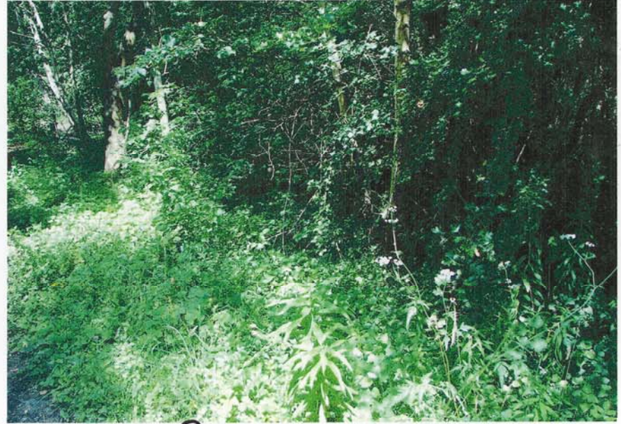
AREA ⑤ CLEAR SOLVE BUT BEWARE LIGHTNING & VIOLETS