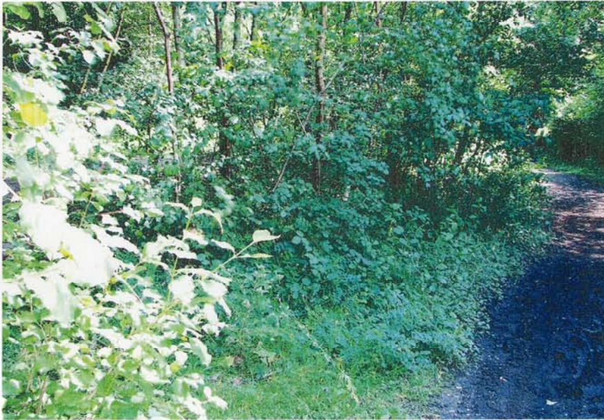
AREA ② CLEAR ALL EXCEPT 20A 2 BIRCH