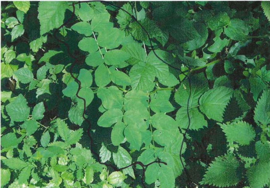
APPEARANCE OF LIQUORICE DO NOT CONFUSE WITH ASH !!