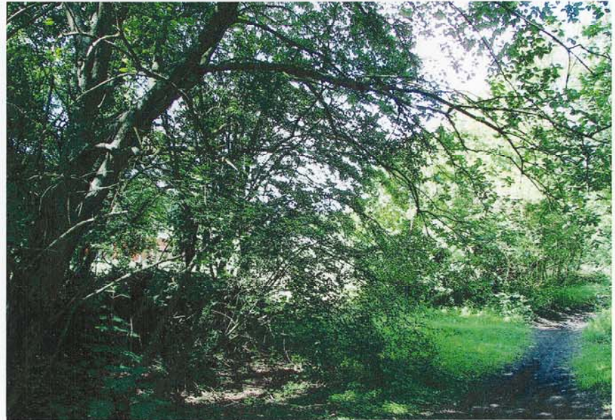
AREA ③ SALLOW OVERHANG