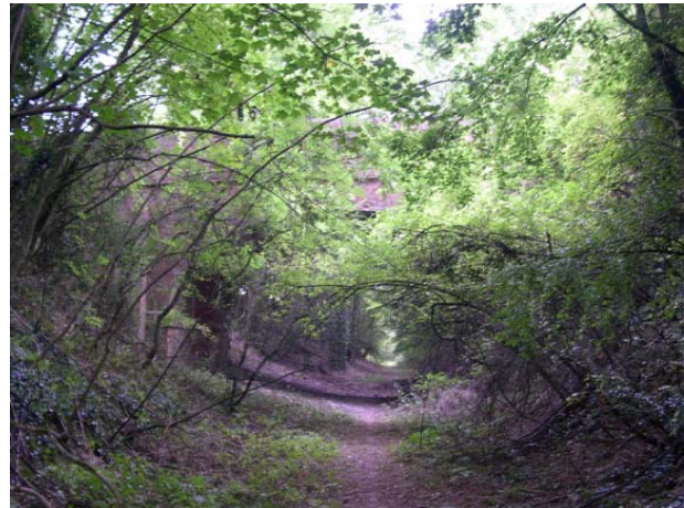
2. Bridge at Bridgetts Lane.