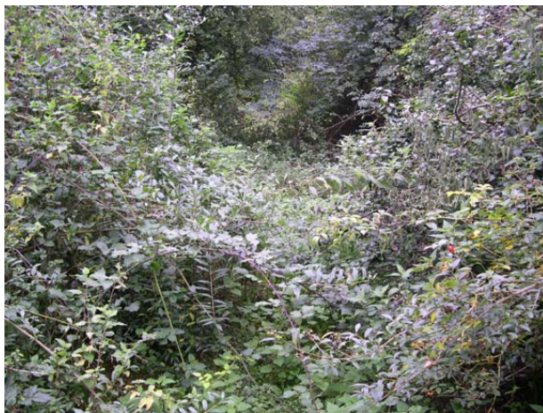
3. Thicket to dense a little after bridge.