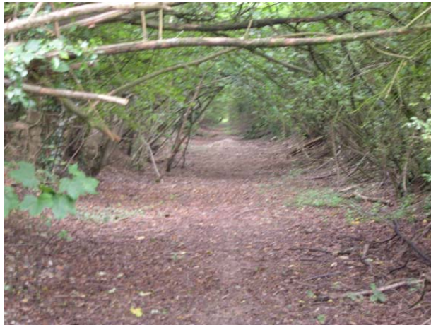
1. Path westwards.