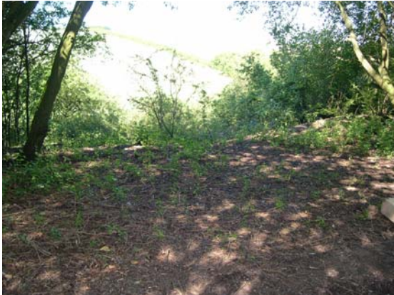
Chosen site for bench in glade.